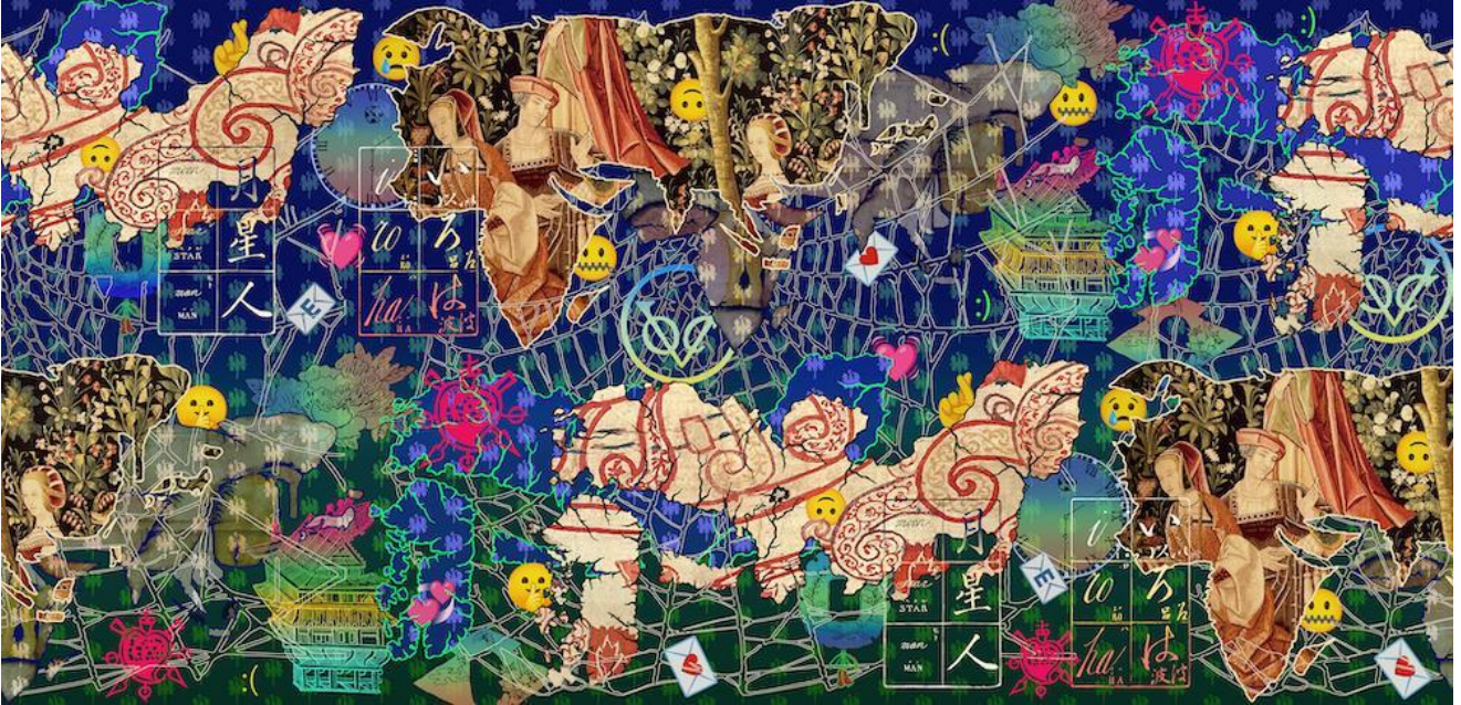
Aiko Tezuka 《Closing and Opening (A Study of Bravery)》 (Design drawing for the textile) 2023, Jacquard weaving, Fabric development and production by Kaji Textile Inc. (Kyoto Nishijin Textile)

KYOTO INTERCHANGE, a Kyoto-based institution of contemporary art, is pleased to announce the solo exhibition "AIKO TEZUKA" from January 22 (Monday) to March 17 (Sunday), 2024.